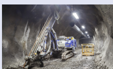
Nuclear & NORM industries (mining, nuclear waste, oil & gas industry...).