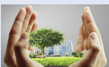
Monitoring Radon in homes & workplaces